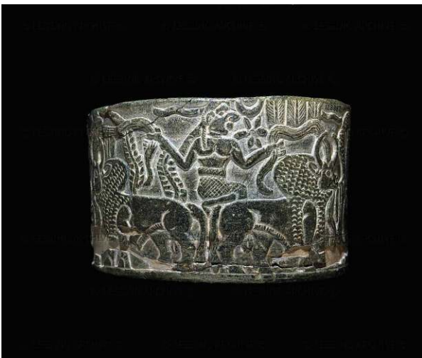
Fig.2: Khafajeh bowl , currently in the British Museum.