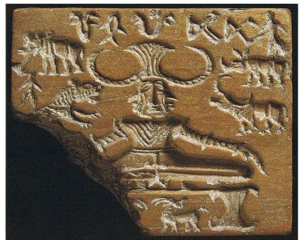
Fig.1. Pashupati seal found at Mohenjo-Daro. (After: Flood: 1996)

The motif on the well-known IC Pashupati seal appears in varied forms at many IC sites. A typical male figure of a central deity sitting cross-legged is the central image on all these seals (fig. 1). The large number of such seals indicates their importance. The Rig Vedic god Rudra is known as Pashupati in both YV and AV. There is a complete hymn devoted to Lord Pashupati in Atharva Veda (AV 2.34). The seal depicts the visual embodiment of the hymn (Pathak 1991a, 1991b). The fact that the hymn is in the